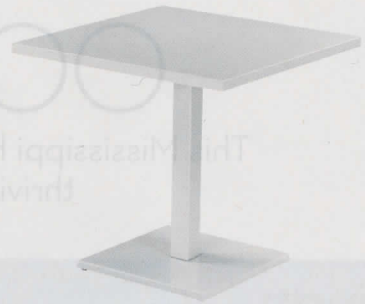
TABLE SERVICE Every room needs a sleek surface, and this lacquered metal table rises to the occasion. Christophe Pillet for emu Round Garden Table (31" by 31" square), $413; ambientdirect.com

PRETTY IN PINK A bright throw pillow breaks up neutral furniture with a hit of color. Furbish Studio Pink Linen Pillow Cover , $50; furbishstudio.com