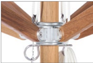
ALUMINUM HUB ANODIZED SILVER W/ STAINLESS FITTINGS