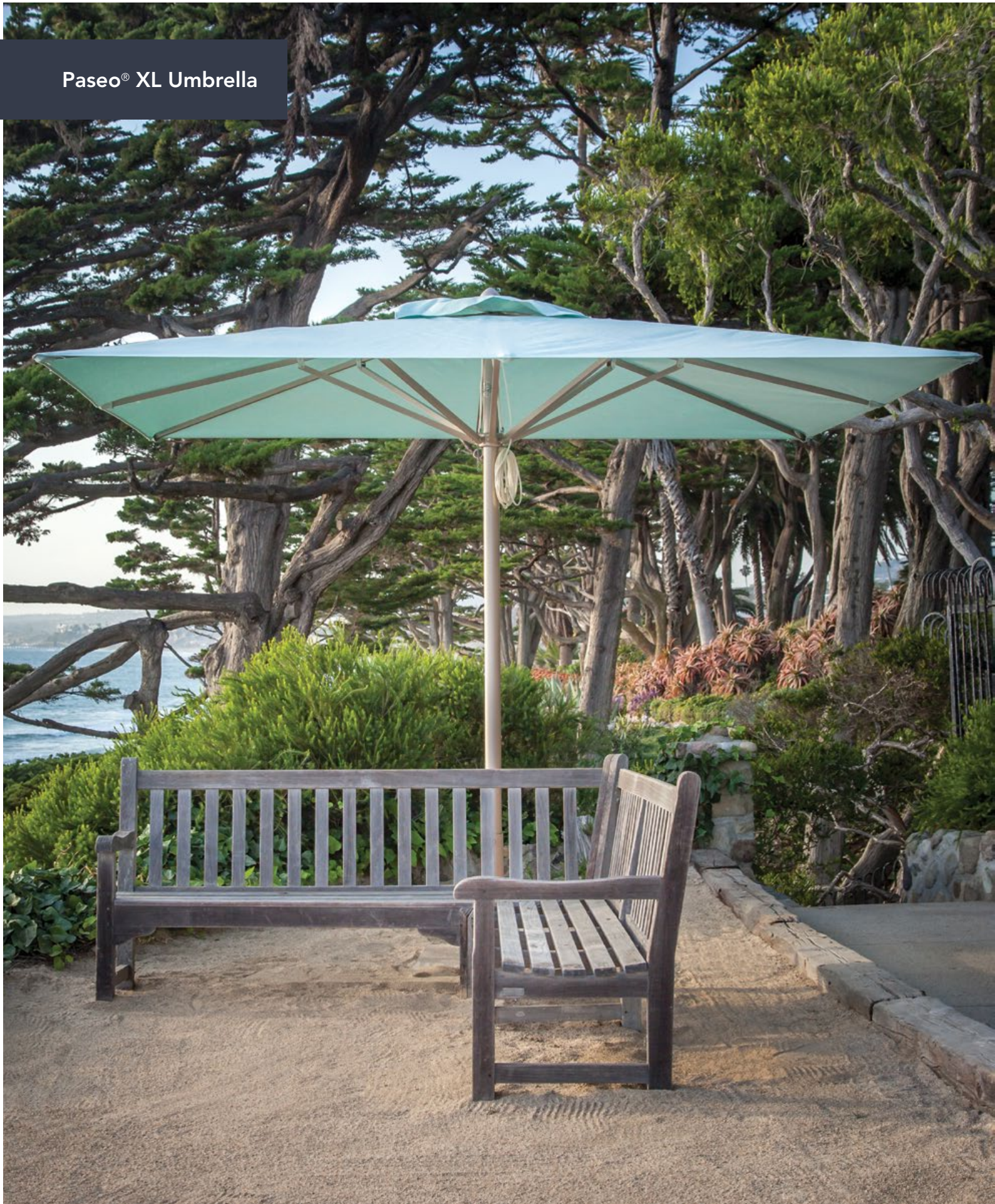
Paseo® XL Umbrella