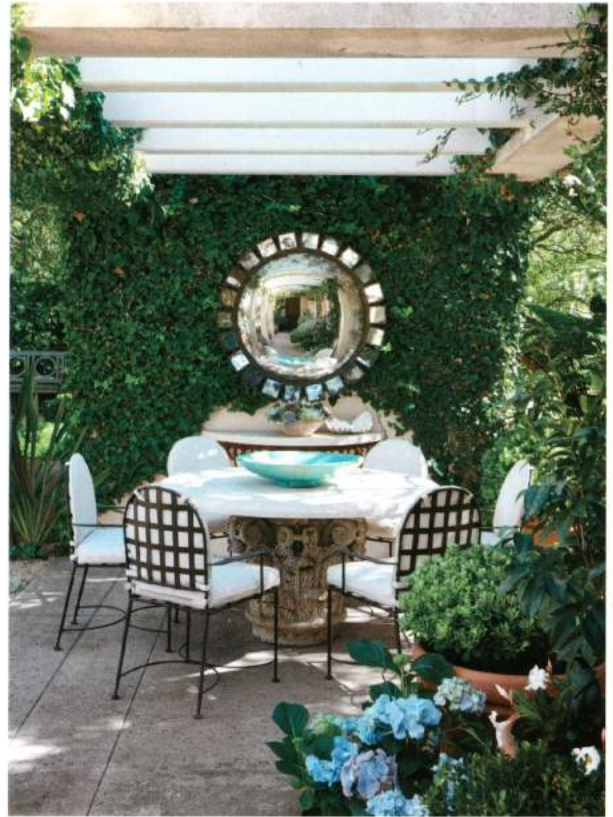
THIS PAGE, CLOCKWISE FROM TOP: Pale woods and creamy whites brighten the small, sunny kitchen; wheeled cart, Suzanne Kasler for Hickory Chair; sink fittings, Grohe; custom lantern, Paul Ferrante. On the loggia, a pillar-capital table base with a limestone top; mirror, Formations. Pool chairs with cushions in Sunbrella fabrics, Murray's Iron Works; umbrella, Santa Barbara Umbrella; kumquat trees in terra-cotta planters. OPPOSITE: California live oaks surround an outdoor dining area. Dining chairs, Murray's Iron Works; woven pendant, Hollyhock. For more details, see Sourcebook.