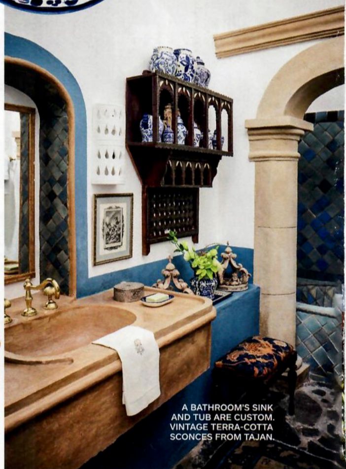
A BATHROOM’S SINK AND TUB ARE CUSTOM. VINTAGE TERRA-COTTA SCONCES FROM TAJAN.