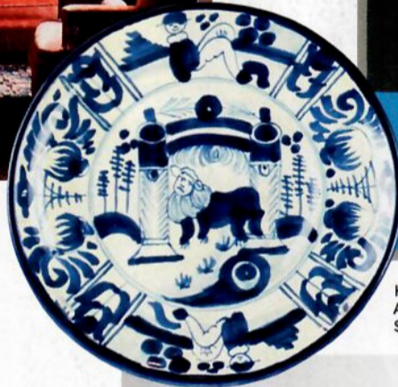
HAND-PAINTED MEXICAN BLUE-AND-WHITE DINNERWARE; FROM $48. MICHELLENUSSBAUMER.COM