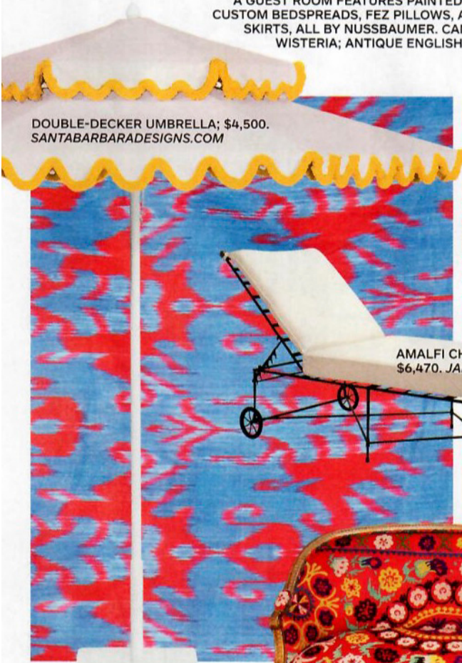
DOUBLE-DECKER UMBRELLA; $4,500. SANTABARBARADESIGNS.COM