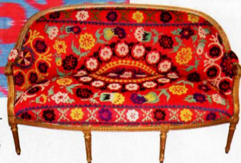
19TH-CENTURY GILDED LOUIS XVI-STYLE SETTEE IN VINTAGE SUZANI UPHOLSTERY FROM CEYLON ET CIE; $6,264. 1STDIBS.COM