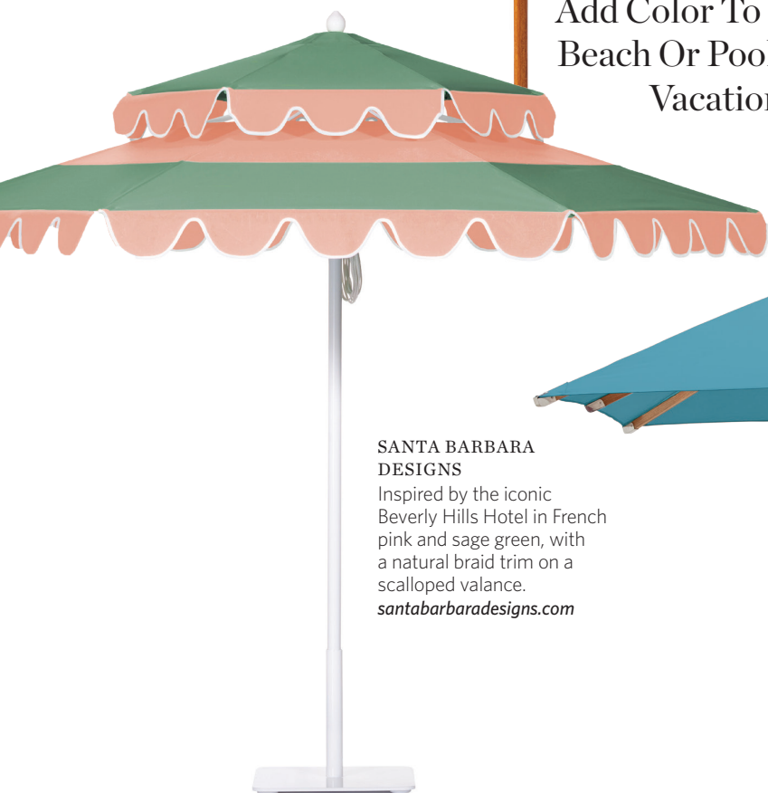
SANTA BARBARA DESIGNS Inspired by the iconic Beverly Hills Hotel in French pink and sage green, with a natural braid trim on a scalloped valance. santabarbaradesigns.com

Add Color To Your Sandy Spot On The Beach Or Poolside To Create A Perfect Vacation Retreat At Home