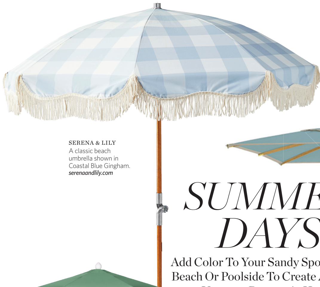
SERENA & LILY A classic beach umbrella shown in Coastal Blue Gingham. serenaandlily.com

GIATI Square Teak Apogee with milled in France fabric. giati.com Available through Dunkirk San Francisco 415/863-7183, dunkirkssf.com