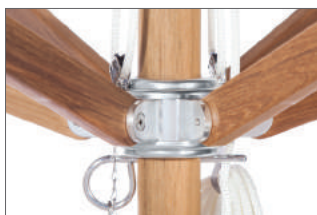
ALUMINUM HUB ANODIZED SILVER W/ STAINLESS FITTINGS