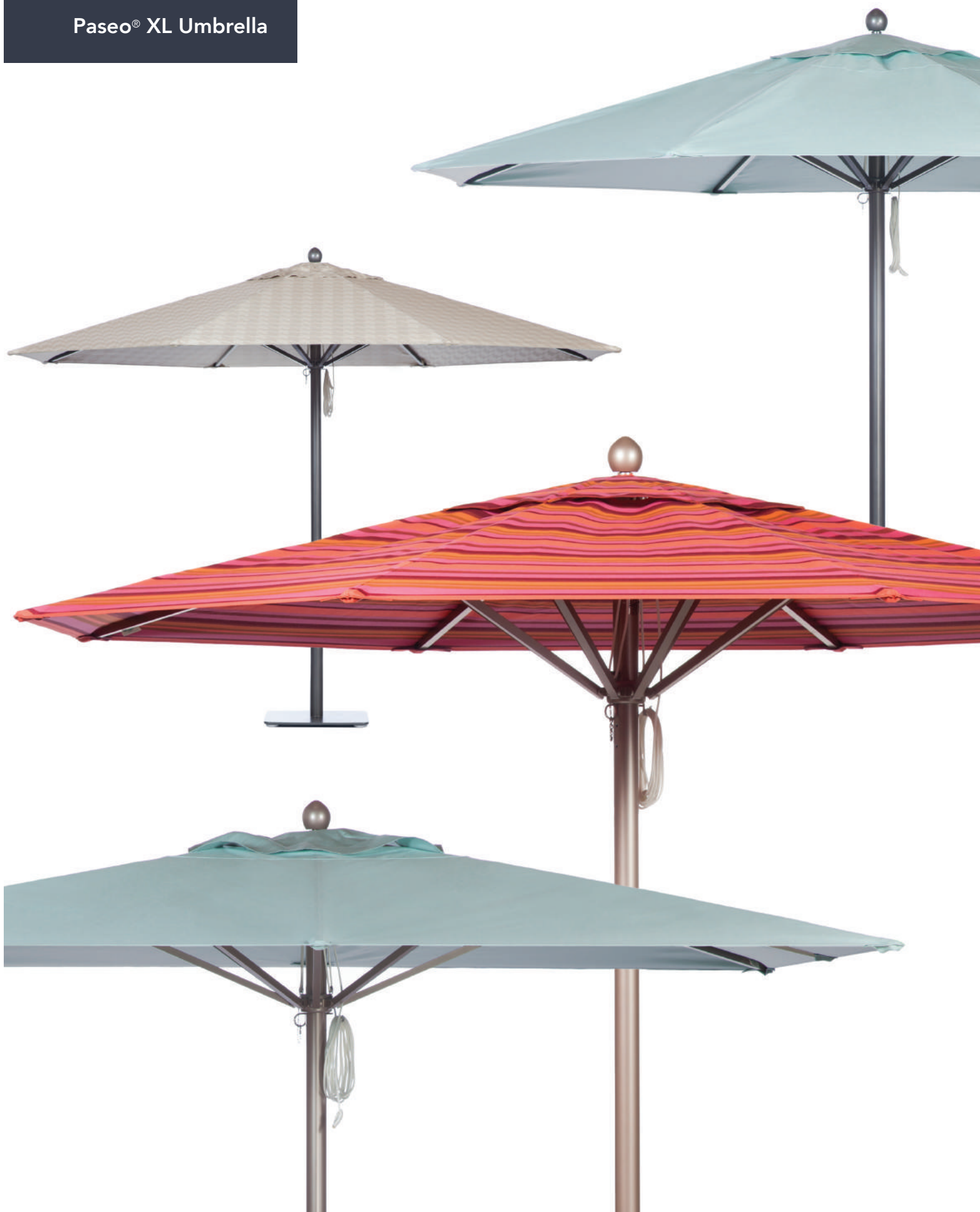
Paseo® XL Umbrella