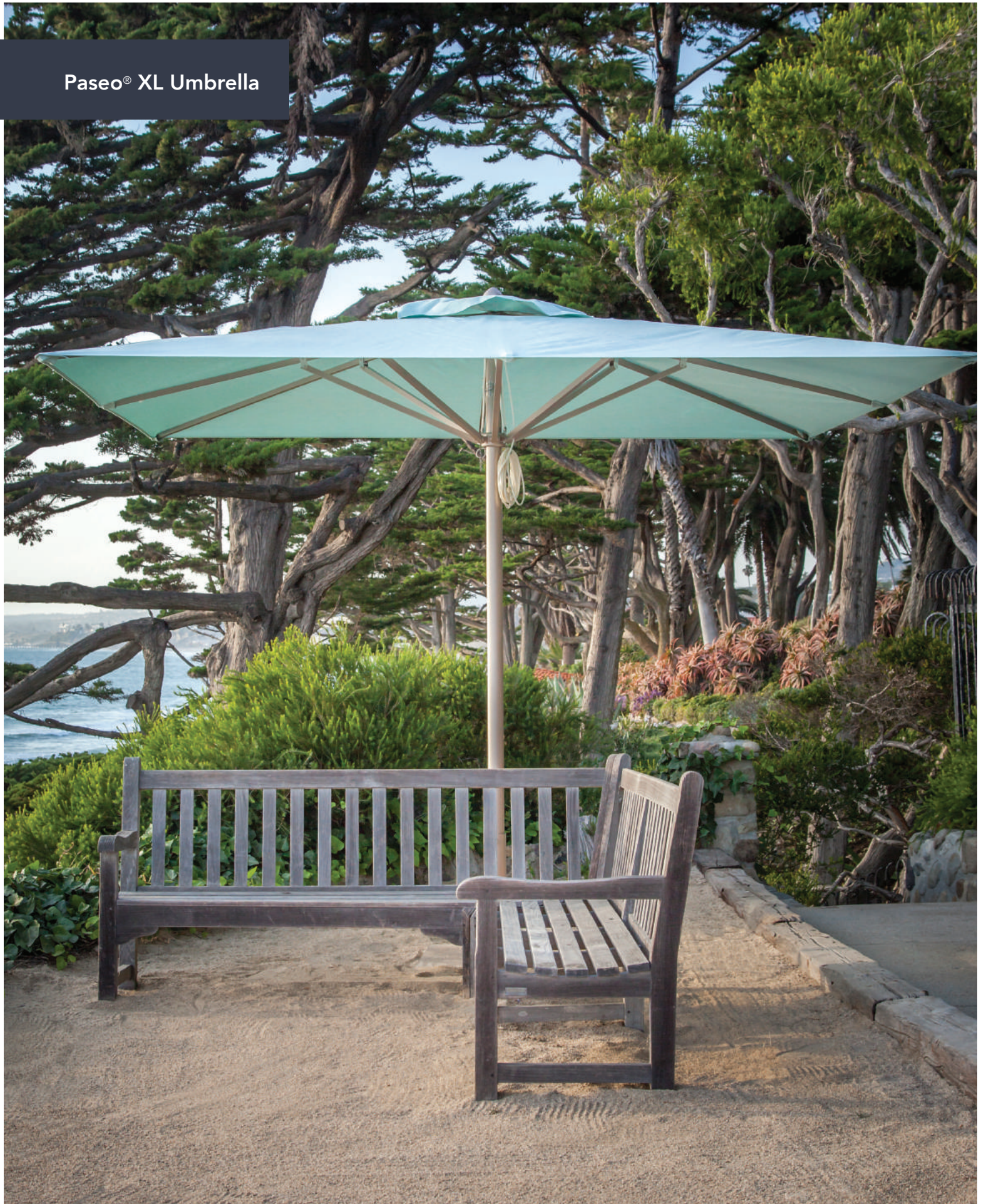
Paseo® XL Umbrella