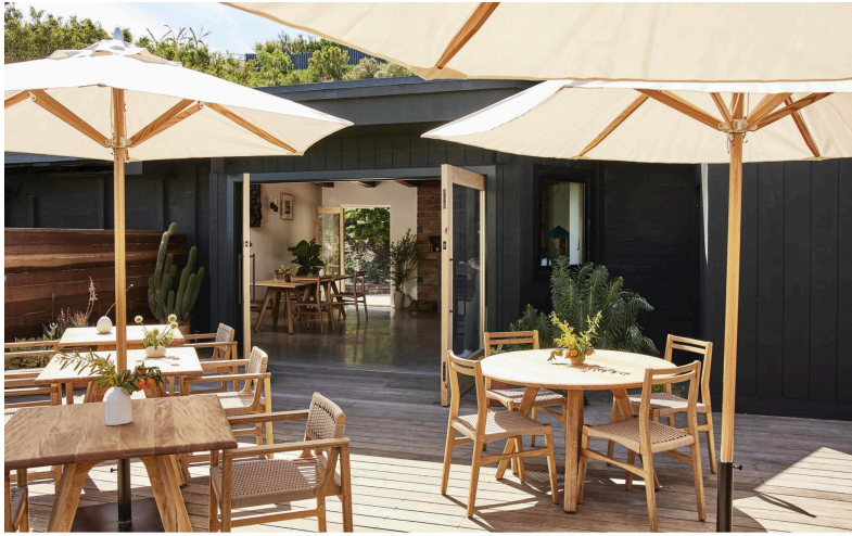
OUTDOOR PATIO The hotel's spacious patio provides a wonderful venue to enjoy the bar's light eats.

ly owner, Wayne Wilcox, highlight the walls of each room. Marmarino plaster walls add texture and warmth and bathrooms feature white clé tiles and unlacquered brass, creating a light-filled, warm feel. Amenities such as Casper beds, Aesop bath products, custom-made deadstock, African fabric robes, curated mini-bars, high-speed Wi-Fi, and on-site parking provide additional comfort.