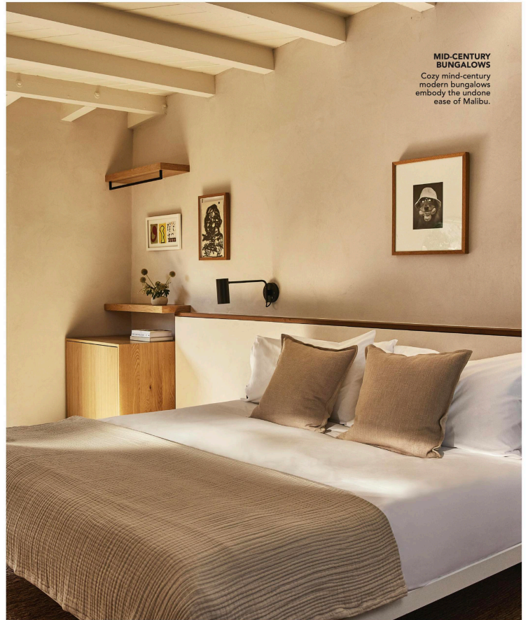
MID-CENTURY BUNGALOWS Cozy mid-century modern bungalows embody the undone ease of Malibu.

Hotel June Malibu 28920 Pacific Coast Highway, Malibu (424) 644-0517 www.thehoteljune.com/malibu