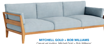
MITCHELL GOLD + BOB WILLIAMS Casual yet inviting, Mitchell Gold + Bob Williams' Alys outdoor sofa sports an angular natural teak frame with deep lounge-like cushions in a choice of 18 fabrics. $5,327, Greenwich, mgbwhome.com.