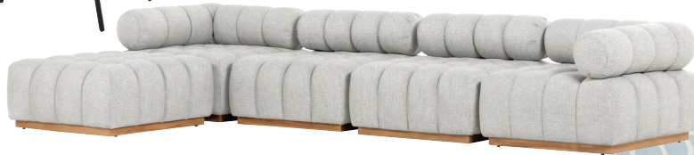
FOUR HANDS A modern take on a midcentury Italian design, the Roma outdoor sectional from Four Hands beckons you to sit and relax with exaggerated proportions and dramatic tufting on a plinth-style teak base. $7,725, fourhands.com.