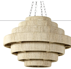
PALECEK All-weather synthetic wicker is finely wrapped around a powder coated metal frame to form the Evelyn outdoor pendant by Palecek, suitable for covered outdoor use in a damp location. $2,676, available through Chbe Winston Lighting Design, chbewinstonlighting.com, palecek.com.