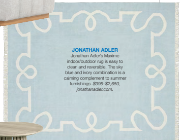
JONATHAN ADLER Jonathan Adler's Maxine indoor/outdoor rug is easy to clean and reversible. The sky blue and ivory combination is a calming complement to summer furnishings. $995-$2,650, jonathanadler.com.