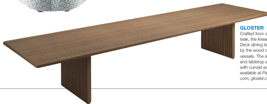
GLOSTER Crafted from solid plantation teak, the linear style of Gloster's Deck dining table was inspired by the wood docking on sailing vessels. The slatted frame and tabletop are softened with curved edges. $23,100, available at Patio.com, patio.com, gloster.com.