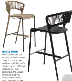
HOLLY HUNT The Salamander bar stool from the Sonoran collection is the latest addition to Holly Hunt's outdoor series. Offered in Raven or Fawn colorways, the woven design and piping structure can stand up to the most rugged outdoor environments. Price upon request, hollyhunt.com.