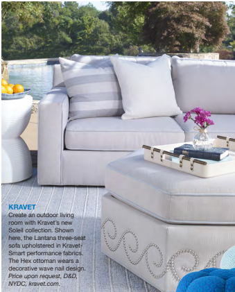
KRAVET Create an outdoor living room with Kravet's new Solist collection. Shown here, the Lantana three-seat sofa upholstered in Kravet's Smart performance fabric. The Hex ottoman wears a decorative wave nail design. Price upon request. D&D, NYDC, kravet.com.