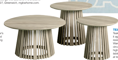
TEAK WAREHOUSE Teak is a natural in the garden because it ages beautifully and is weather resistant. The Emma table from Teak Warehouse is made with a smooth, circular top set on a slatted base in a high-quality and durable teak. Corbie table, $749; side table, $399, available at teakwarehouse.com.