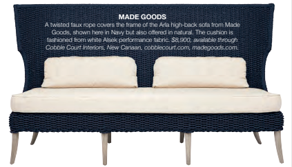
MADE GOODS A twisted faux rope covers the frame of this Alys high-back sofa from Made Goods, shown here in Navy but also offered in natural. The cushion is fashioned from white Alys performance fabric. $8,900, available through Cobble Court Interiors, New Canaan, cobblecourt.com, madegoods.com.