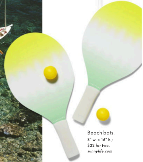
Beach bats. 8" w. x 16" h.; $32 for two. sunnylife.com