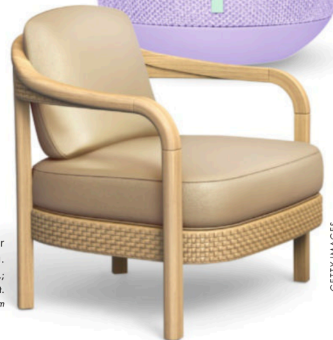
Terence armchair by Armani/Casa. 32" w. x 31" d. x 37" h.; price upon request. armani.com