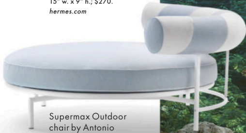
Supermax Outdoor chair by Antonio Citterio for Flexform. 64" w. x 50" d. x 27" h.; price upon request. flexform.com