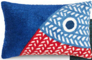
Poisson cushion. 15" w. x 9" h.; $270. hermes.com