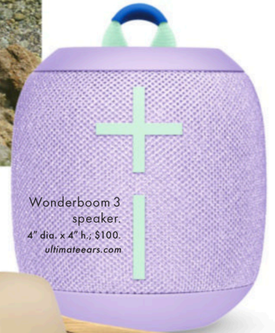
Wonderboom 3 speaker. 4" dia. x 4" h.; $100. ultimateears.com