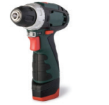
CORDLESS DRILL WITH A 1/8" HEX BIT