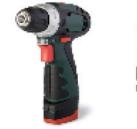
CORDLESS DRILL WITH PHILLIPS HEAD BIT