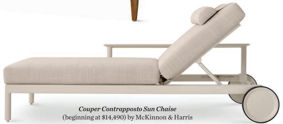
Couper Contrapposto Sun Chaise (beginning at $14,490) by McKinnon & Harris