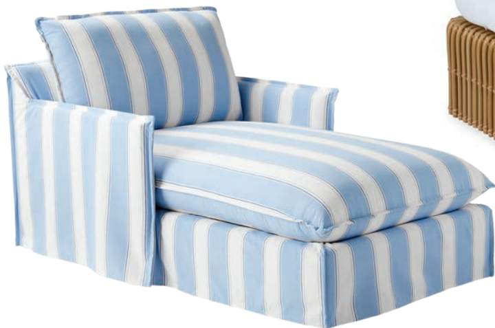
Sundial Wide Chaise in Hydrangea Port Stripe ($5798) from Serena & Lily