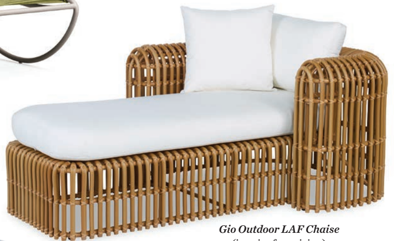
Gio Outdoor LAF Chaise (inquire for pricing) by Carrier and Company for Century Furniture