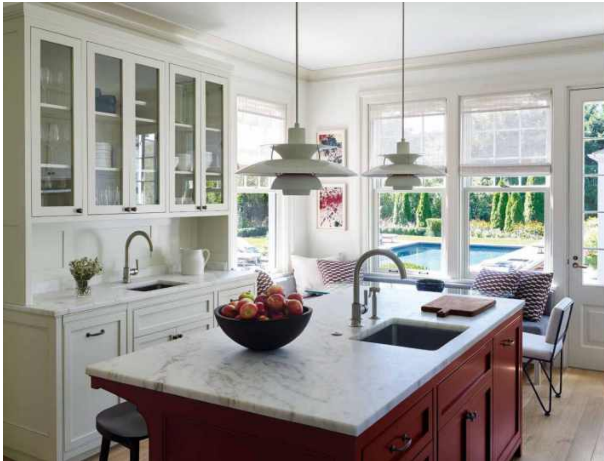
COOKING WITH LIGHT (left) The kitchen took longer than its budget thanks to additions on three sides and a bump-out built into the corner. "It is incredibly efficient," says Sawyer. (right) Island Pendant in Benjamin Moore's Cottage Red, the island and the Luxor Poulsen pendant overhead draw focus in the kitchen. Capoverde the white cabinets. Dark Parsons.