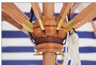
OAK HUB W/ BRASS FITTINGS