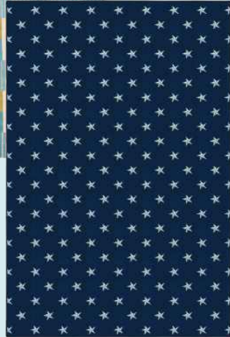
Starland, $113 per square yard, starkcarpet.com