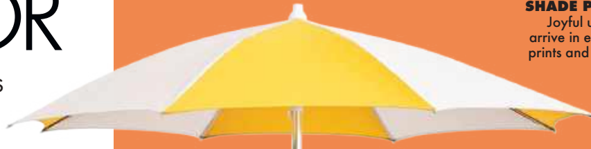
Terrazza parasol by Hay, $345, dwr.com

SHADE PARADE Joyful umbrellas arrive in exuberant prints and patterns.