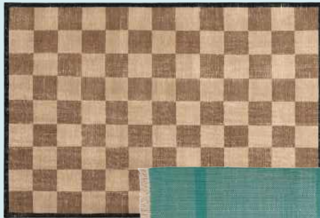
Terra 01, from $795, nordicknots.com