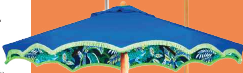
Iggy umbrella by Thibaut x Santa Barbara Designs, $6,950, santabarbaradesigns.com